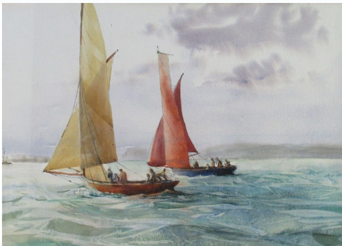
Artwork unseen for 30 years

General Exhibition - Saturday and Sunday 16th-17th - 10.00am - 6.00pm - all welcome