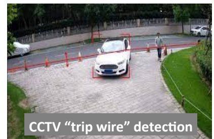
CCTV "trip wire" detection